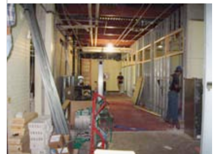
Centennial’s JOC afforded the ICCSPC a competitively bid, collaborative and responsive solution for projects like the Malcolm X College’s 2nd Floor training facility, shown here under construction.