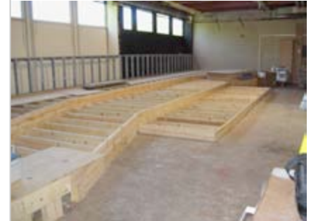
The Illinois Community College System Procurement Consortium (ICCSPC) awarded Centennial a Job Order Contract for renovation, rehabilitation and repair of its network of 48 community colleges and one multi-college center catering to nearly one million students.